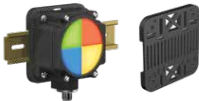
SMBDX80DIN for mounting to 35 mm DIN Rail